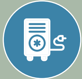
Medically required heating or cooling