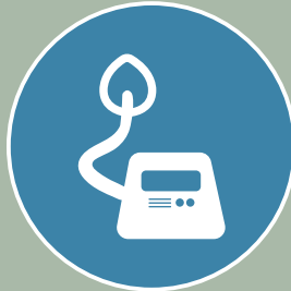
Chronic positive airways pressure respirator (CPAP)