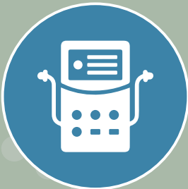
Ventilator for Life Support

Tjinguru nyuntu machine nyanga palunya tjananya kanyirampa Cowell Electric-pangka tjakultjura.