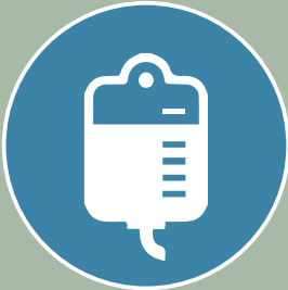
Kidney dialysis machine