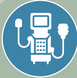
Intermittent Peritoneal Dialysis machine